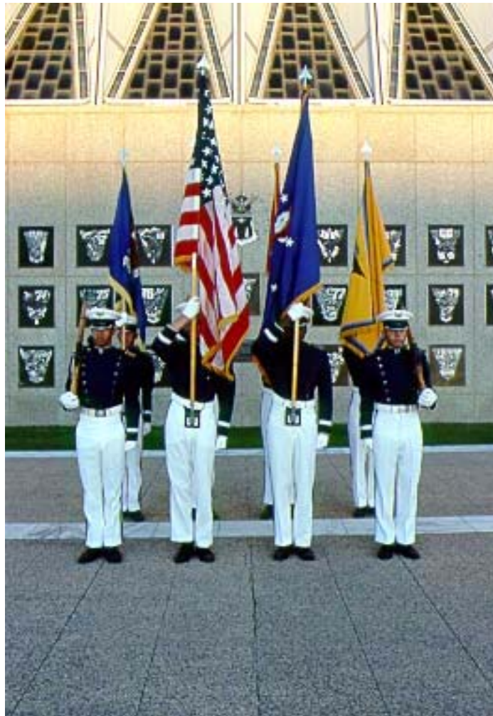
Cadet Honor Guard

Students should apply to their Senior ROTC Instructor for the nomination. Members of college and high school honor Air Force Reserve Officer Training Corps (AFROTC and AFJROTC) units may also apply in this category. Five students from each detachment may be nominated to compete for the authorized vacancies. Students should apply for a nomination to their professor of aerospace studies or aerospace science instructor who will recommend nominees to the head of the institution.